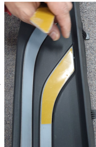
T708GX Die-cut for insert